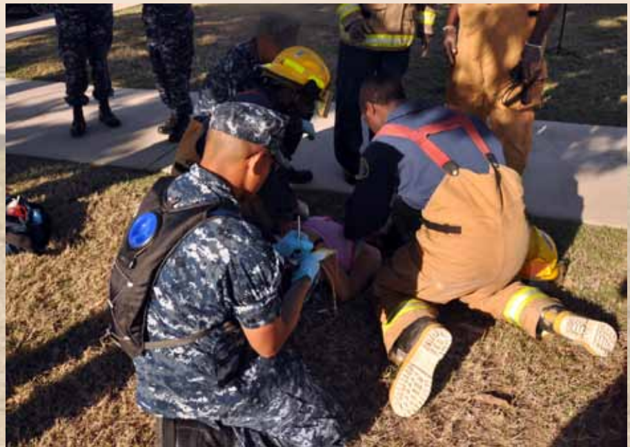
USNH GTMO Personnel and GTMO Firefighters simulate providing medical care to a victim outside the PSD building during the Active Shooter Drill, Feb. 24.