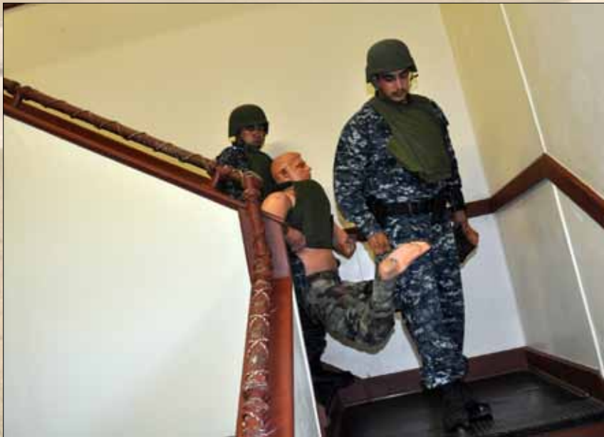
Master-at-Arms assigned to NS GTMO's Security Department carry an 180 pound training dummy down the stairs during the Active Shooter Drill, Feb. 24.