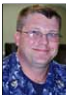
MCC Bill Mesta NS Guantanamo Bay, Cuba, Public Affairs

For those of us stationed at Naval Station Guantanamo Bay, Cuba, it can be easy to get wrapped up in the things we don't have while serving and working on an isolated base. I believe it is important that each of us take a moment every now and then to reflect on all that we should be thankful for and the little things that the members of the GTMO community do to make our lives better every day.