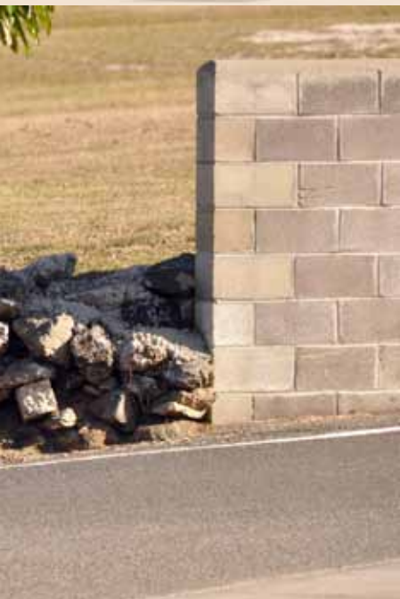
GTMO's Security Department, secures the perimeter during the Active Shooter Drill, Feb. 24.