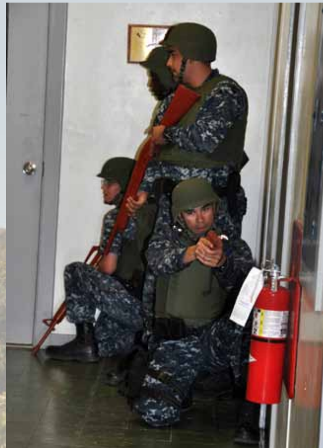
Master-at-Arms attached to NS GTMO's Security Department secure a hall way at PSD during the Active Shooter Drill, Feb. 24.